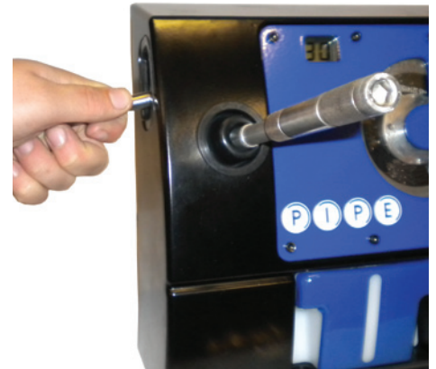
Close-up of the cutting function