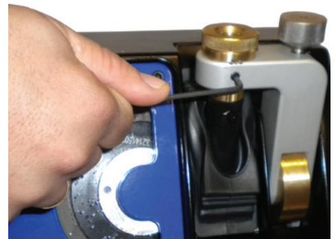
Three position grinding triples life of the wheel