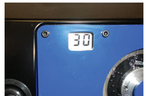
Digital angle readout